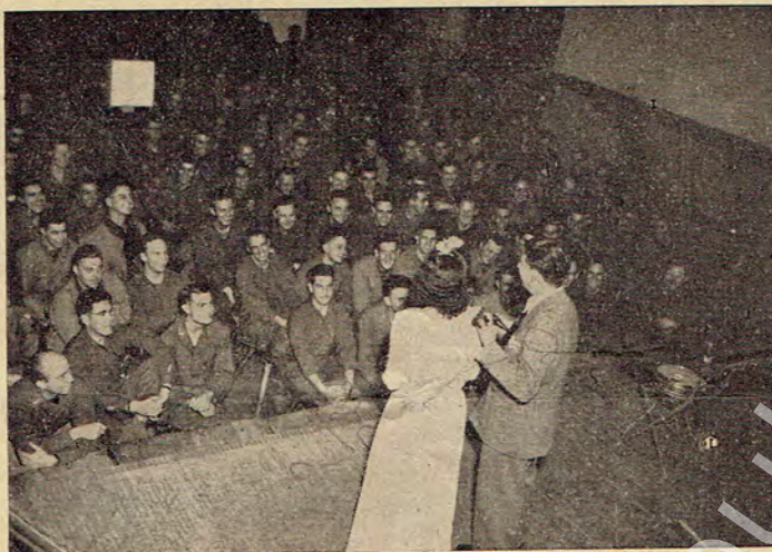
Last week the men of the 83rd were treated to a traveling USO show which played various units in the division. By the look on these "happy" faces it must have been a success.

The civilian is fighting us just as much as the Heinie in uniform Trust him if you want to. That's your business. But remember you're playing on the side of the Yanks. It may mean not only your neck but a knife in the back for your buddy. Watch out for these "Pill Box Annies!"